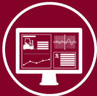
INDIVIDUAL MACHINE HISTORIES