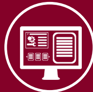
VIEW ENGINEER JOB SHEETS