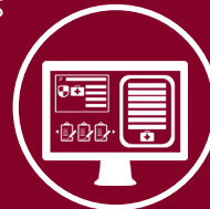
UP TO DATE SHEQ INFORMATION