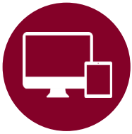
WEB BASED ACCESS VIA TABLET, SMART PHONE OR PC

FLEET / CONTRACT MANAGEMENT SYSTEM WITHOUT THE NEED OF A TELEMETRY DEVICE.