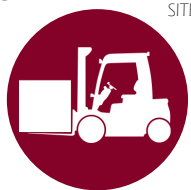
ACCEPTS CUSTOMERS OWN FLEET NO'S