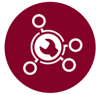
LOG BREAKDOWNS & SUBMIT METER READINGS