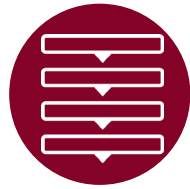
4 TIER ACCESS CORPORATE, REGIONAL, SITE, DEPARTMENT