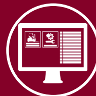
OPEN JOB REPORTS