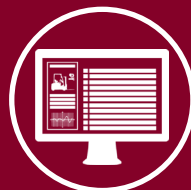
PM SERVICING REPORTS