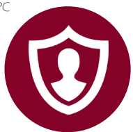
USER PROFILE UNIQUE USER ID & PASSWORD